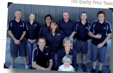
The Quality Print Team.